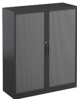
3 Shelf Tambour Cabinet 900 Width REC45 W1200 D460 H2000