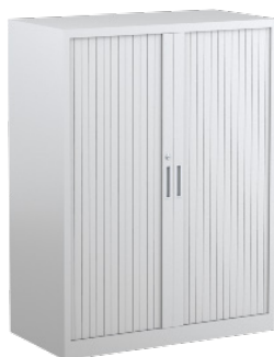
3 Shelf Tambour Cabinet 1200 Width REC47 W1200 D460 H2000