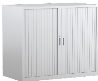
2 Shelf Tambour Cabinet 900 Width REC44 W900 D460 H1020

Tambour Cabinets feature doors which recede into the cupboard carcass making them ideal for confined areas and narrow corridors. The stylish design is perfect for any office. Each unit is AFRDI quality approved.