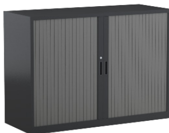
2 Shelf Tambour Cabinet 1200 Width REC46 W900 D460 H1020