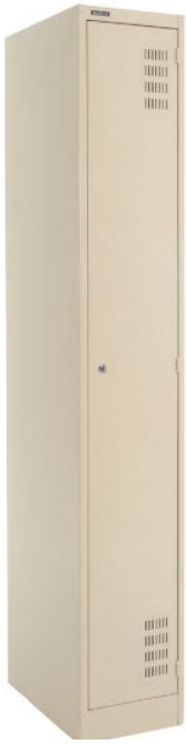
REL01 - Single Door Locker