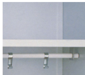
Hat Shelf/Coat Rack/Coat Hook