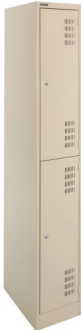
REL02 - 2 Door Locker