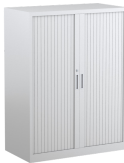
3 Shelf Tambour Cabinet 1200 Width REC45 W1200 D460 H1200