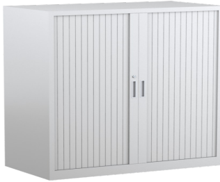
2 Shelf Tambour Cabinet 900 Width REC39 W900 D460 H1020

Tambour Cabinets feature doors which recede into the cupboard carcass making them ideal for confined areas and narrow corridors. The stylish design is perfect for any office. Each unit is AFRDI quality approved.