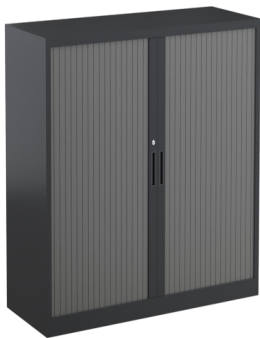
3 Shelf Tambour Cabinet 900 Width REC44 W900 D460 H1200