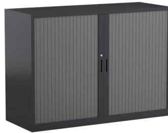
2 Shelf Tambour Cabinet 1200 Width REC43 W1200 D460 H1020