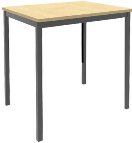
Slimline Single 450 Desk RET0945 W600 D450 H720

Slimline Student Desks are durable classroom tables that seat two students comfortably. Similar to our Oxford range, the Slimline range instead features 25mm square tube legs.