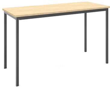
Slimline Dual Desks W1200 D600 RET01 H500 RET02 H545 RET03 H605 RET04 H650 RET05 H720