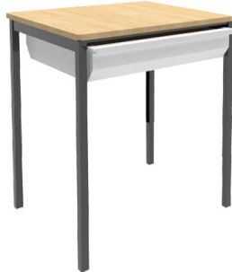
Slimline 450 Student Desk + tray RET0945T W600 D450 H720