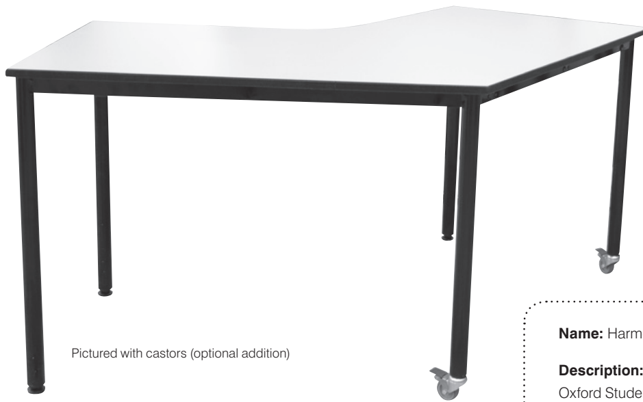
Pictured with castors (optional addition)