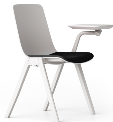
RES176 Belief Tablet Chair