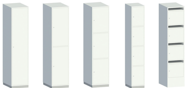
REL-T1 REL-T2 REL-T3 REL-T4 REL-T4P

Options: Sloping top Customised shelving End Panels & Top Capping Hooks and Mirrors Numbering / ID Placards Padlock tongue or keylock Padlock scratch plate Wide range of colours Custom sizes